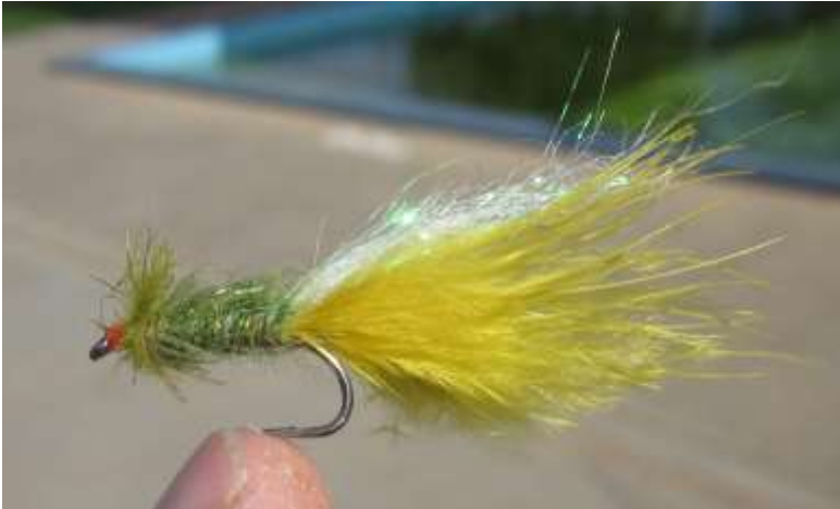
Doug Kimberley's Streamer

Photos of all the flies allocated during the event were displayed on a screen in the clubrooms before dinner on Saturday, and as the flies were displayed there was plenty of discussion between younger fly fishers over the merits of the flies they and others had been allocated with. Ironically their negative opinions were not reinforced by the performance of some of the flies