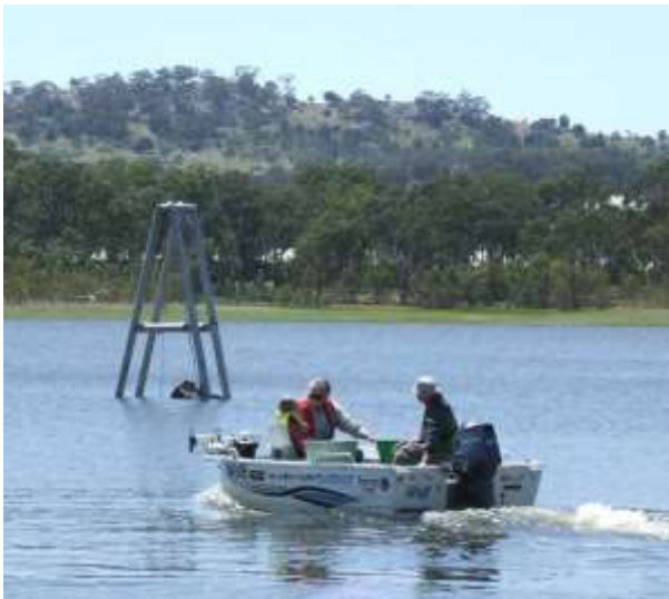
Going out to deliver another load